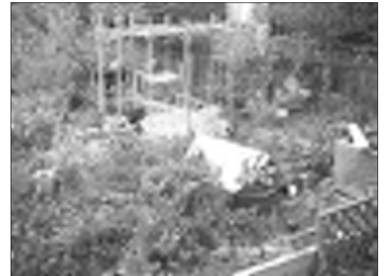
Fall 2004: New Gardener's abundance