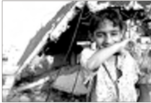
A young boy next to bombed apartment house where many residents were killed.