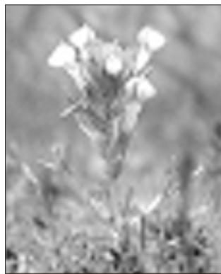
Rosy owl-clover and bearded owl-clover are both endangered in Canada

What was the landscape like in Fernwood before European settlers arrived? If you had asked me before I started working with the Garry Oak Ecosystems Recovery Team (GOERT), I would have guessed that the land was covered with Douglas-fir forest. But it was actually a luxuriant parkland of oaks, grasses, shrubs and flowers, as described by early settlers. First Nations people had used fire to maintain open meadows in order to cultivate camas lilies whose bulbs were a staple carbohydrate source for them. Left undisturbed, many of the meadows probably would have been eventually overtaken by Douglas-fir forest. Imagine standing here two hundred years ago and being surrounded by Garry oak savannah as far as the eye could see. Most of greater Victoria was like that. Now there is less than 5% of that habitat left in Canada.